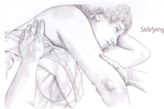
Fig 4 Placement of draping with client side lying