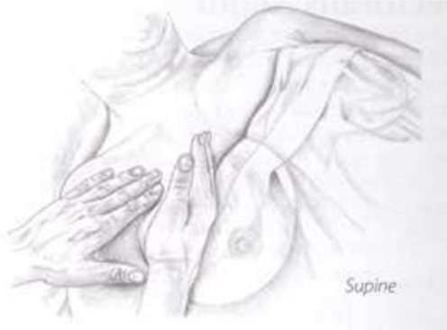
Fig 3 Placement of draping with client supine