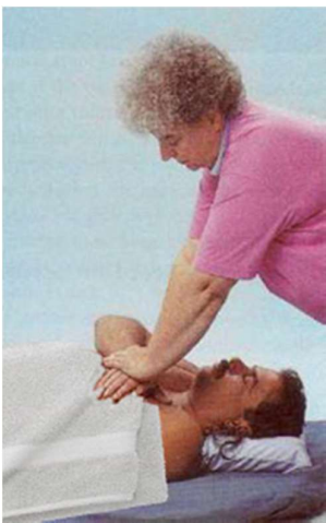
Fig 5 Use of client's hands to depress tissue