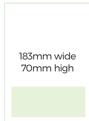
THIRD PAGE (Horizontal)