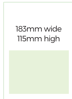
HALF PAGE (Horizontal)