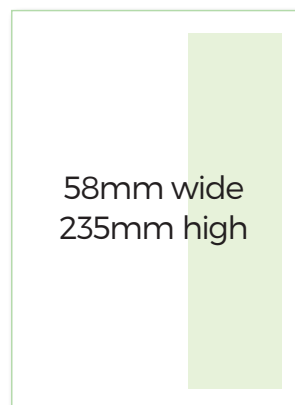
THIRD PAGE (Vertical)