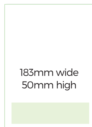
QUARTER PAGE (Horizontal)